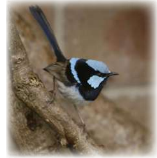
Photo of local wren sighted in Boyce Street by Stewart Whittlestone.

Superb Fairy-wrens are small insect-eating birds. They need a habitat which offers both food and security. This means providing open space for foraging as well as growing insect-attracting plants, and shelter plants for roosting, nesting and security from territorially aggressive birds and predators, both avian and mammal. Consequently a good Superb Fairy-wren garden will not be 'neat and tidy', but tend more to the wild, organic and unruly.