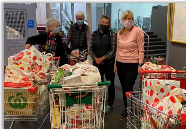
Glebe Society members collecting food donations at Broadway Shopping Centre for the Glebe Youth Service