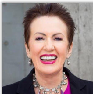
Lord Mayor Clover Moore