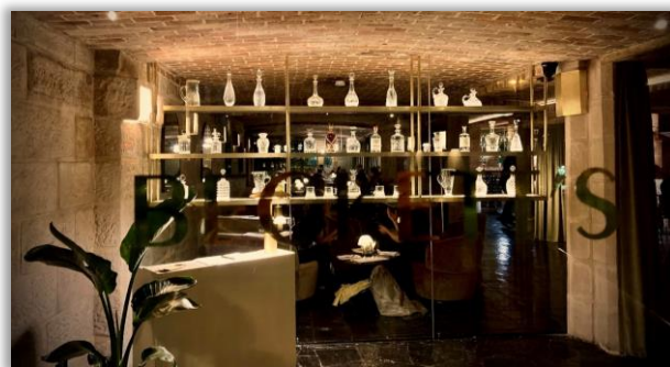
Beckett's, the location of this year's Glebe Society Christmas Party