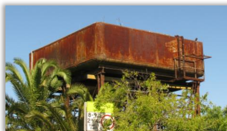
The water tower at Harold Park viewed from Maxwell St in 2013

One of the requirements of the DA for the development of Harold Park was that the water tank associated with the Rozelle Tram Yards be reinstated. Since Tramsheds was built, the Glebe Society has been trying to find out when this was going to happen, as the delay was considerable! I learnt yesterday that the reinstallation of the water tank became a separate DA to the original because stand-alone issues related to this were causing serious delays to the re-opening of the otherwise completed complex.