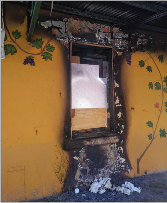
Recent scorch damage