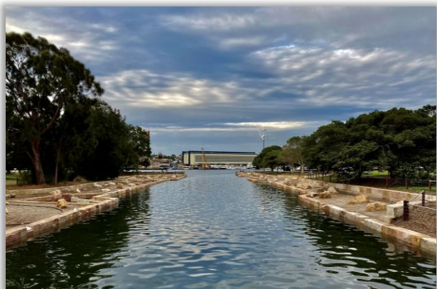
Naturalised Johnstons Creek

site and volunteers will need to be given an induction to permit work on the site – induction is planned for early in 2022.