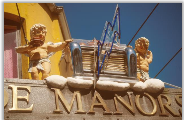
Badde Manors cherubs, 1999

Sources: Bellingen Gelato Bar; NSW registry of births, deaths, marriages; NSW State Records; Trove website