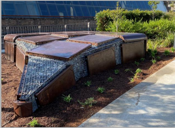
The artwork, Immerge, was created by artist, Chris Fox, from the old Harold Park water tower

It seems that the negotiations between Mirvac, City of Sydney and the artist were lengthy and complex. The artist's original design was to reinstate the water tank itself, raise it above ground and make it seem like it was 'sort of flying away'. However, hairline cracks in the metal and the inability to guarantee the absolute safety of the new installation (and/or possibly the extraordinary cost of achieving this) meant this design was scrapped in favour of what we see.