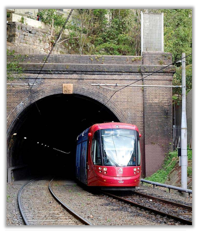
A light rail service exiting the heritage Glebe Railway Tunnel

1. http://www.environment.nsw.gov.au/heritageapp/ViewHeritageItemDetails.aspx?ID=4803228.