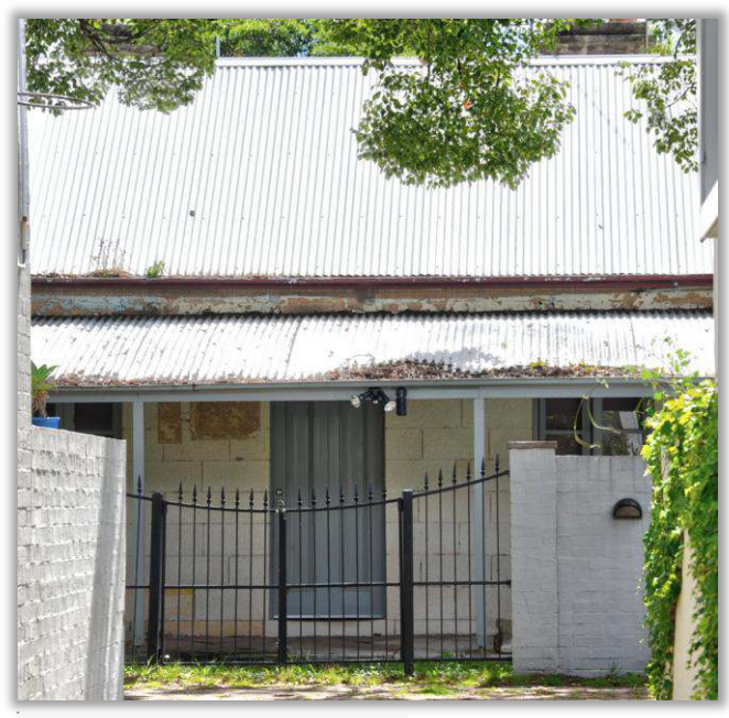
Yelvertoft

boundary. Other modern terraces have already been built on Alfred Rd toward Minogue Cres, and the Society is arguing that any further terraces should share their generous setbacks, and that the footpath provided by those setbacks should be extended along the entire terrace. At the same time, an adequate curtilage should be provided for Yelvertoft .