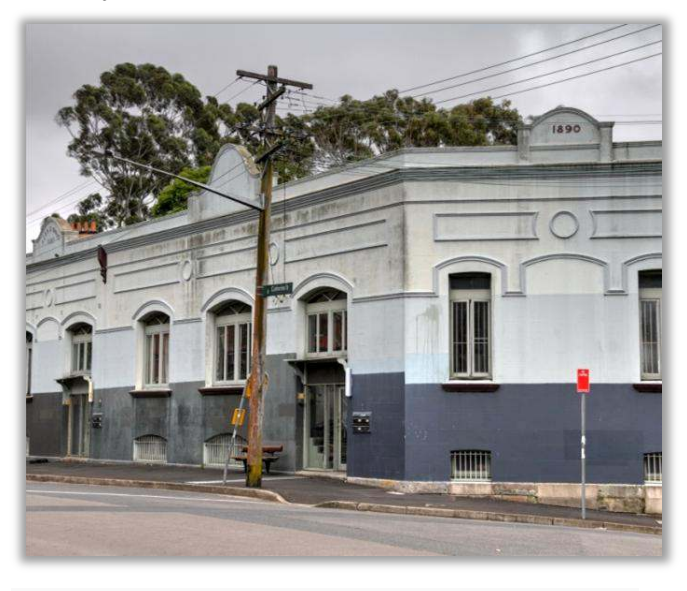
7-9 CatherineSt, as it looks today

The photo below shows how the building looks today.