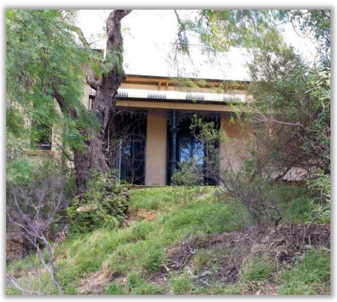
Bellevue – looking neglected – in late 2017

The City Council is continuing its assessment of the Development Application for Bellevue – the Heritage listed cottage situated in Blackwattle Park at Glebe Point. The DA is for the 'Use of existing building known as Bellevue Cottage for a licensed restaurant for 152 patrons and café for 96 patrons with hours of operation between 6am and 10pm, 7 days per week.'