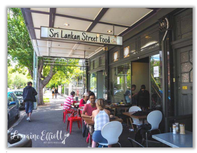
The newly-opened, Sri Lankan Street Food restaurant, where Thirsty Thursday will be held in May