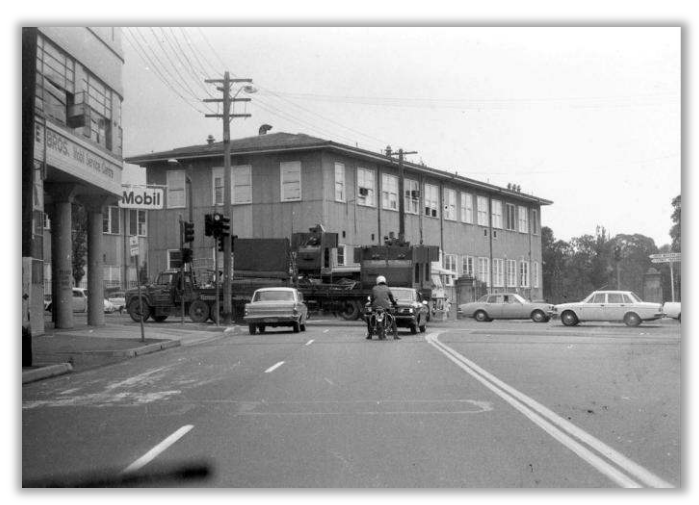
Corner of Ross St and Parramatta Rd, in about 1973, when the Officeworks building had a Mobil service station on the corner under the building.