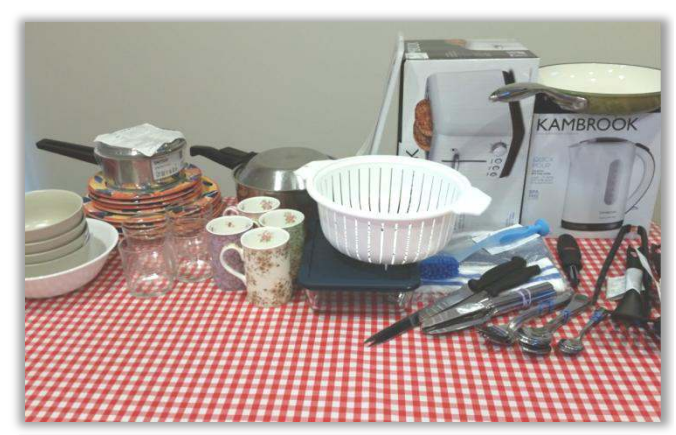
Another of the Kitchen Starter Packs.