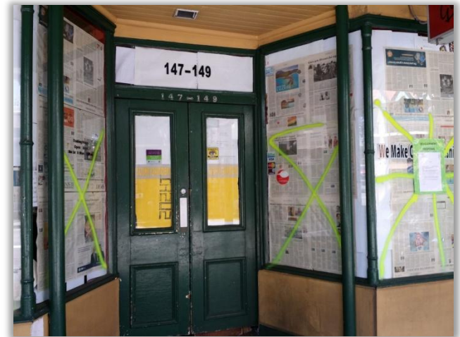
147-149 Glebe Point Rd, former Sushi Garden – possibly the only wooden shop in Glebe.