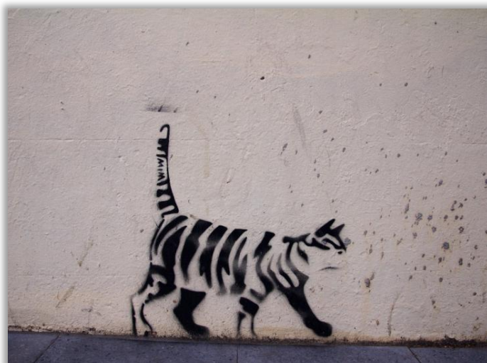
Mim cat stencil in Glebe