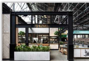
Bekya at the Tramsheds

Please email or ring Edwina on 9660 7066 by 6pm on the Wednesday before to let us know if you are coming, or if you are likely to be late.