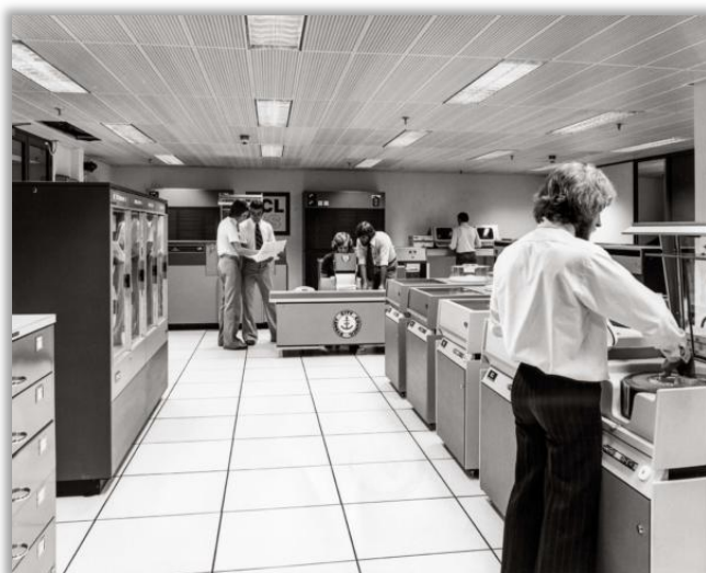
This photograph, from 1977, shows the purpose-built room constructed in Town Hall House to house the council's mainframe computer.

https://whatson.cityofsydney.nsw.gov.au/events/our-city-175-years-in-175-objects