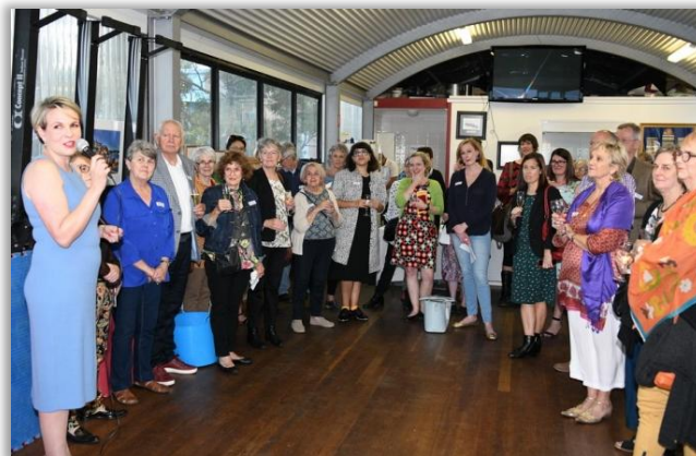
Local member, Tanya Plibersek, addresses the gathered crowd at the Sunset Soiree for Centipede.