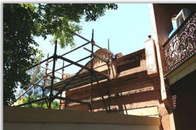
The old butcher's shop on the corner of Franklyn St and Glebe St. The venue is being refurbished by City of Sydney.