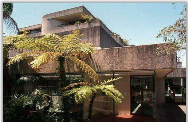
Brutalism meets Blacket: The Bidura Children's Court