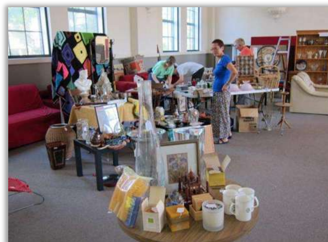
'Glebe Grunge and Glory': Glebe Society participates in the Garage Sale Trail.