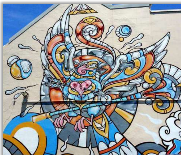
Wall art on a terrace wall, corner of Bridge Rd and Taylor St, Glebe