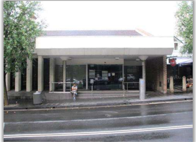
Former Commonwealth Bank building, Glebe Point Rd