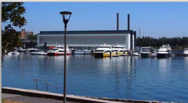
Dry Boat Store (2014), looking north from the Glebe foreshore

Doubtless the aesthetic and historic sensibilities of foreshore walkers across the bay were very far from the mind of the designer of this monolith. Certainly, the dry boat facility has significantly changed the sight-line towards the north from Glebe. Storage operations are due to commence this month.