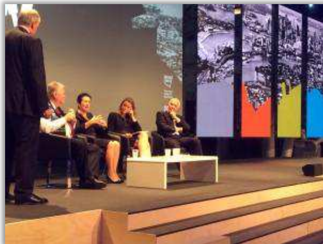
Lord Mayor Clover Moore on a panel at the Summit. Clover Moore used her keynote address to illustrate the City's many successful urban renewal projects that have integrated community input, delivered bigtime for the public good, won recognition for innovation and quality and been financially viable.

Finally it must be noted that it was a lavishly resourced Summit: huge numbers of support people, security (not sure of the purpose), props, technology, documentation, and FOOD.