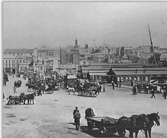
Horse drawn wagons at the wharves at Circular Quay, c.1890s