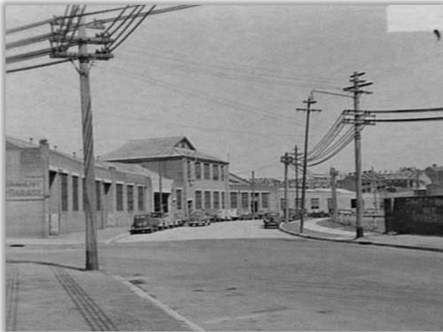
The Government Motor Garage at 7 Bay St Glebe in 1953

If you have not already done so, please take a few minutes to sign this Charter at http://thecommunitycharter.org/ . It is important to keep up the pressure on the State Government in the lead up to the State Election in March, so any changes to the planning legislation are in accordance with the needs of the wider community, not just developers.