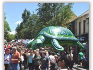
Scenes from the 2014 Glebe Street Fair