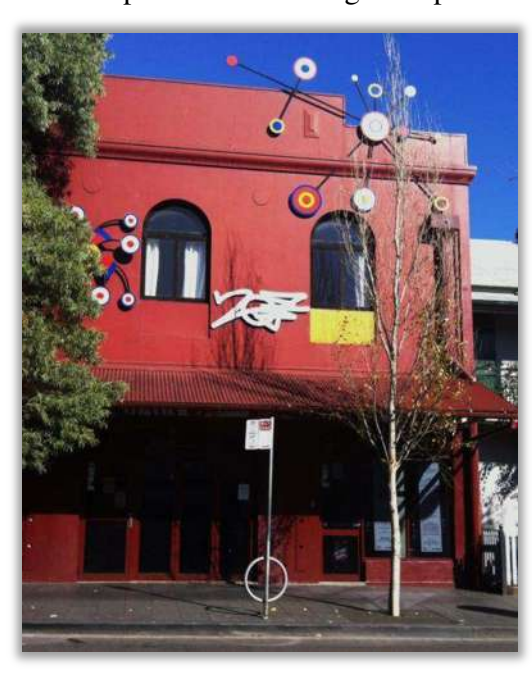
Glebe Youth Service

However, further development of this community discussion was largely overtaken by more urgent needs when the precipitous 'lock out' of the Glebe Youth Service (GYS) occurred, late in 2013. The Glebe Society gave unwavering support to community action to restore the service to its premises in Glebe Point Rd, which Housing NSW allowed in March 2014 after essential remedial works were undertaken. Another specific need, i.e. for children under the age of 12 with an Aboriginal cultural identity with respect to care, 3pm-6pm weekdays was partially addressed by some extension of GYS services with parents' input, after GYS's reoccupation of their long-term premises.