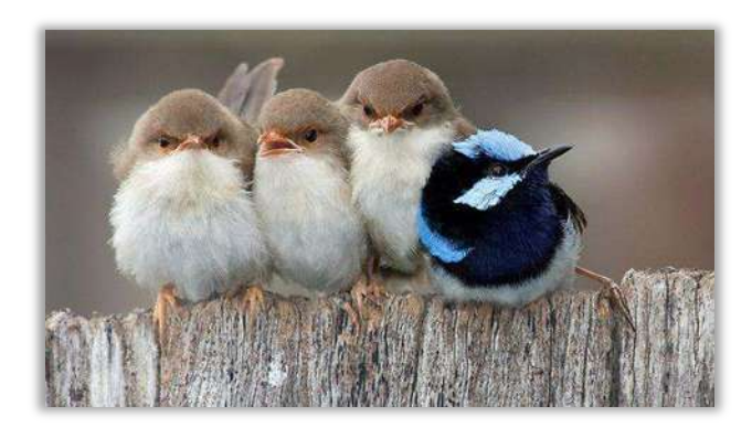
Superb Fairy Wren chicks and an exhausted father.

industrial site) showed that the first 30-40cm of the surface soil is contaminated and will need to be removed and replaced with clean topsoil. These works are to be completed by the end of 2015 when planting of the Reserve will commence.