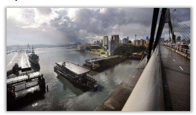
Glebe Island Bridge

The highlight of the reporting year was the listing of the Glebe Island Bridge on the State Heritage Register. The Glebe Society was one of many organisations which supported the National Trust's push for the Bridge's heritage listing. This was in the face of a concerted effort by RMS to have the Bridge demolished (and eerily echoed an attempt by Government to demolish the nearby Pyrmont Bridge in the 1980s). The Glebe Society argued for the retention of the Bridge, not only on important heritage grounds, but as a potentially valuable conduit for cyclists and pedestrians to and from the city.