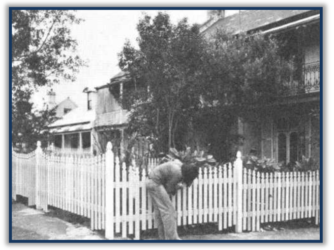
Fencing after rehabilitation<sup>3</sup>