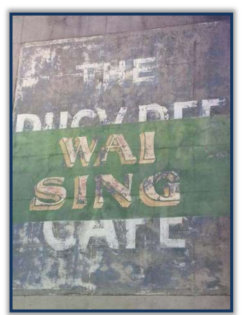
Dixon Street Image: V. Simpson-Young and a whiz with chopsticks.

ten years I would be a habitué of Dixon Street