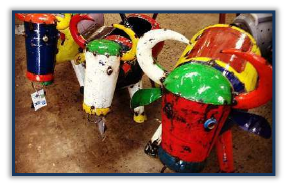
The Works, Glebe

A useful source of up-to-date information on restaurants, bars, shops and events in Glebe and Forest Lodge is Time Out Sydney's Glebe Area Guide (<u>http://www.au.timeout.com/sydney/area-guide/glebe/22</u>). This site would be great for visitors to Glebe and probably worth checking it out next time you're looking for something to do. Alongside pieces on Glebe institutions such as Gleebooks, you'll find pieces on newly-established businesses such as The Works and Ombretta. There's also details on upcoming events such as the intriguingly-named Phuklub (Sunday evenings at the Roxbury Hotel).