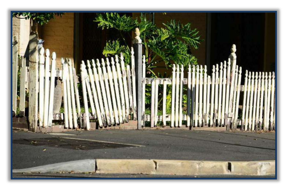
Fencing today – cnr St Johns Rd and Derwent St

arrangements. They would be. They were. They are.