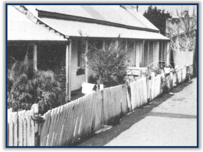
Fencing before rehabilitation<sup>3</sup>

requirements included: demolition of external toilets/sheds/lean-tos, excavation for sewerage/garden area, new bathrooms and kitchens, redecoration and repair, site works such as fences, clotheslines, trees. A 1974 inspection showed that most houses had leaking roofs which had caused damage to electrical wiring. So reroofing the entire Estate was the first improvement to set The Glebe Project off to a great start. Rusty brown corrugated iron roofs were replaced with slate or grey 'Colorbond' steel. Tenants were interviewed to show tradesmen where the leaks were.