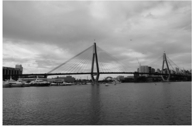
Anzac Bridge from the end of Glebe Point Road.

The Glebe Society has prepared a submission protesting that the new fencing along the southern side of the bridge and the permanent gantry will significantly detract from the linearity, elegance and beauty of the bridge. The net effect is that the bridge deck will look significantly heavier and more cluttered.