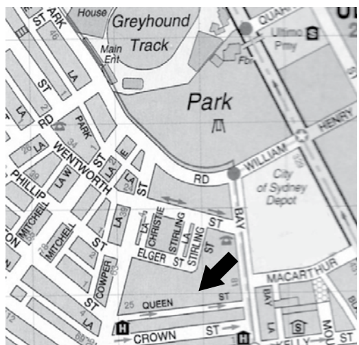
Map showing the location of the 'affordable' housing project.