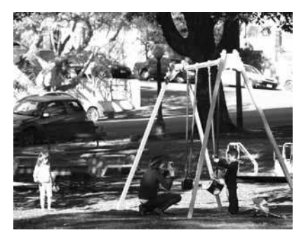
Kids playing in Jubilee Park.