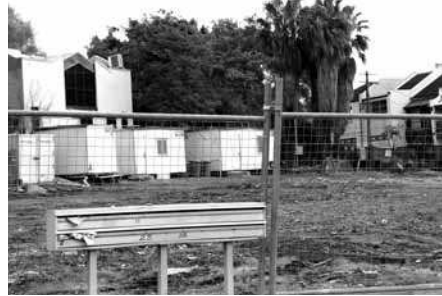
Letter boxes are all that remain on this part of the site.

The site itself does not contain buildings of Heritage value (although it does contain at least one element that should be conserved; the foundation stone laid by