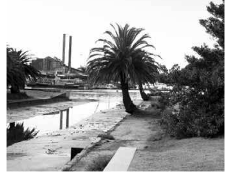
Palm trees and saltmarsh.

Palms do not have extensive root systems, nor do they have spreading canopies. As far as I know they are not allelopathic<sup>2</sup>. It could be that Council is aware of evidence of adverse effects