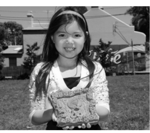
A Glebe resident shows off a tile made for the park.