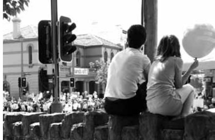
Some watched the rally from a distance.

An' when they go, as like as not, we find we're taken in,