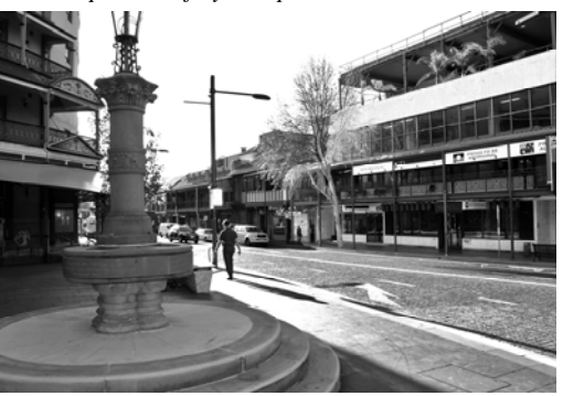
Glebe Point Road with refurbished Jubilee Fountain.

... One of the significant features of this project was the extent and the innovation in community consultation. For example the City employed a community liaison officer for the construction phase. The outcome of the project was to turn a tired landscape with poor traffic control and poor pedestrian amenity into a vibrant streetscape with well managed traffic and bus activity and renewed interest in the restaurant precinct with much greater public safety and pedestrian access.