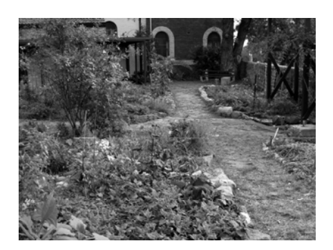
The community garden in St Johns Road.