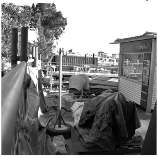
The junk behind the fence.

The longer term future is more promising. Maritime is currently assessing proposals for the foreshore from the