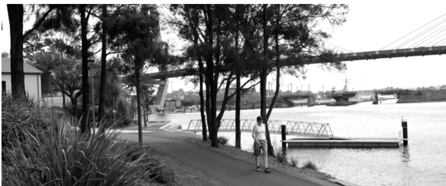
All we need is a use for Bellevue that would allow visitors to come by boat and use our lovely new pontoon.