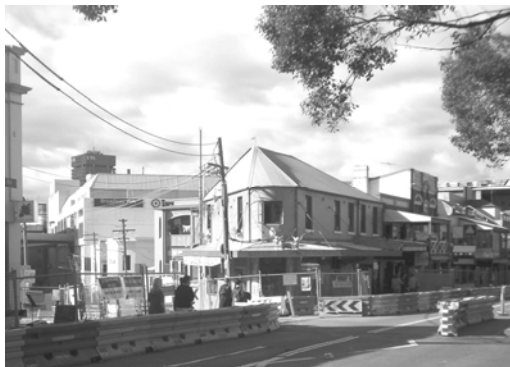
Glebe Point Road, Sunday, 22 June.

And let this be a warning to all householders. Don't leave the home maintenance jobs until the house is about to fall down - it will cost you more financial pain and inconvenience in the end.