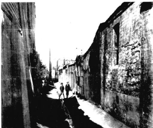
Raw sewage ran through the open drains in Athlone Place, Ultimo (1906).

The Commissioners of the 1876 Sydney City and Suburbs Sewerage and