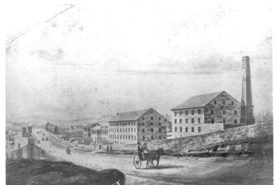
Colonial Sugar refinery, Parramatta Street (now Parramatta Road) (1850s). Fitzgerald, Chippendale, Beneath the Factory Wall , Halstead Press, 2008, p. 43.