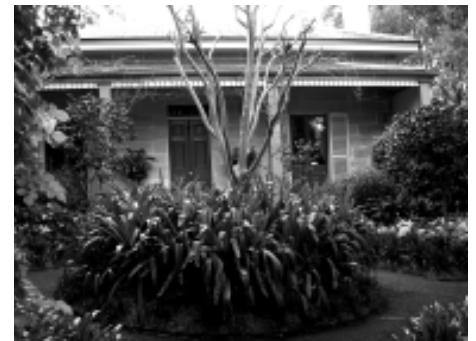
The Retreat.

The owners of The Retreat have generously offered their house as a venue for a special Glebe Society event: Champagne High Tea and an opportunity for guests to have a treasured item or "antique" valued