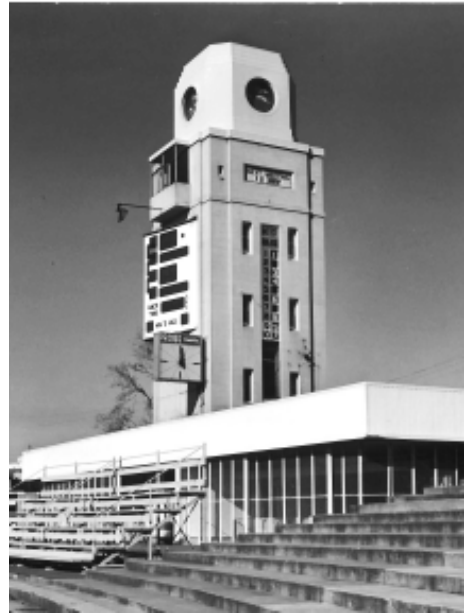
The tower before restoration.

Residents and those travelling through Glebe could hardly fail to notice the rather imposing and unusual tower positioned at the junction of Wentworth Park Road and St. Johns Road.