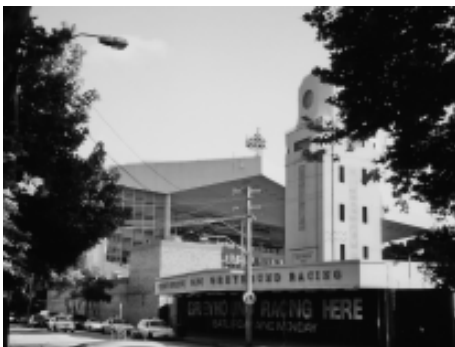
The now-demolished entrance plaza seen from Wentworth Park Road.