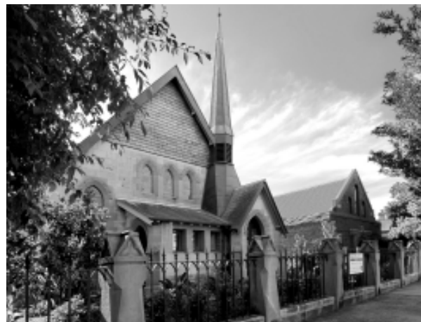
The church and, on the right, the church hall.

From the outside the building appears to be unchanged, but inside it has become a modern