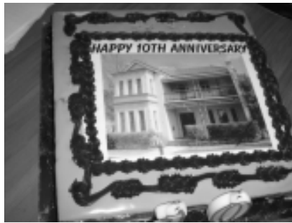
The birthday cake that was cut on 19 April - the Library's actual anniversary.

The hospital, much appreciated by residents and doctors alike, was, like many other small local hospitals, taken over by the Health Department following changes in 1987 to the 1929 Public Hospital Act. It was shut down in 1989. The local community was distressed when the funds which had supported the hospital were absorbed into the general revenue of the Central Sydney Area Health Service, with a token nod to homoeopathic medicine being made at Balmain Hospital. The community still believes it was robbed.