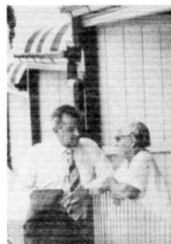
Federal Labor member for Sydney, Les McMahon, chats to a resident of the Glebe Estate in a 1981 preselection campaign photograph, found on a Library of NSW website.

PS: Les later inherited the local Federal seat, and spent some years in Canberra.