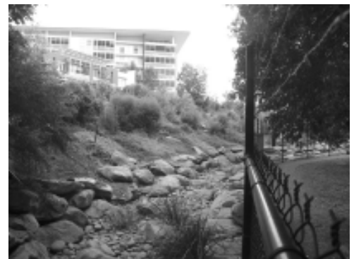
Stage Two gully planting of tube stock after 15 months.