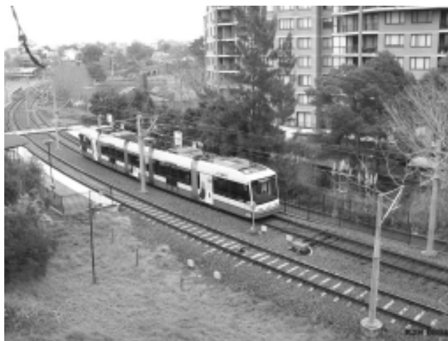
The Light Rail at Ultimo.