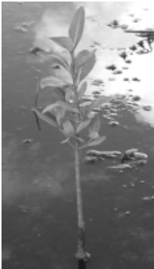
One of the surviving mangrove saplings