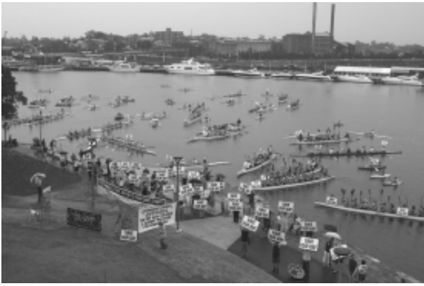
The Massing of the Boats on Rozelle Bay, Saturday 2 December.