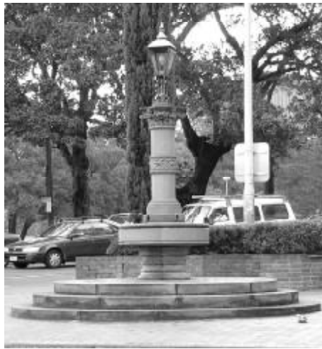
The Jubilee Fountain.

The Jubilee Fountain, at the corner of Glebe Point Road and Parramatta Road, is one of a few commemorative fountains located at roadway intersections in Sydney. The cultural significance of the Fountain site is as a place of commemoration of Municipal Government at The Glebe, which, in 1859, was one of the first local government areas established in NSW.