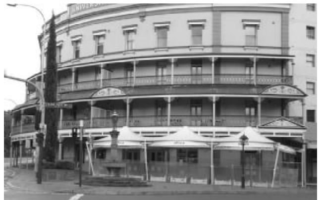
The café on the corner detracts from the fountain.