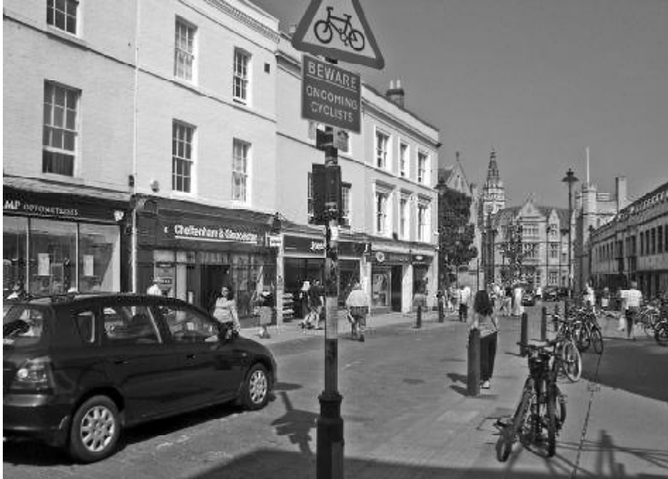
Cambridge Town Centre. Pedestrians share the road with cars, buses and bicycles.