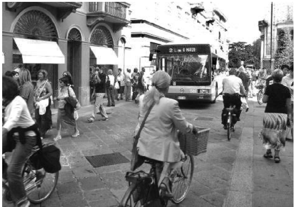
Main shopping street in Parma, northern Italy. Pedestrians mingle with slow moving buses and bicycles.