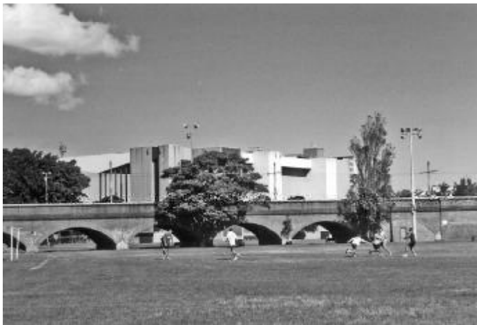
Wentworth Park as it is today.