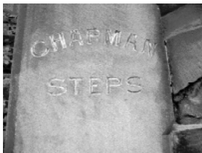
'Chapman Steps' engraved in stone.

... Continued from previous page District Council assumed responsibility. In the 1870s and 80s Sydney Tramways laid tracks along this