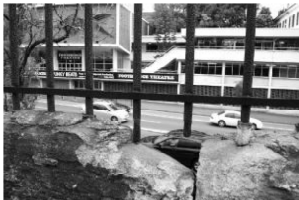
Decaying palisade fence and retaining wall opposite the Footbridge Theatre.

The history of the palisade fence and retaining wall along Parramatta Road, Glebe warrants further investigation. The Parramatta Road itself dates to