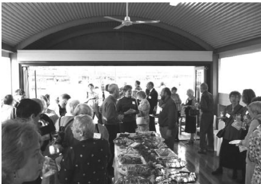
The Glebe Society's party in the Boatshed.

About eighty people were at the Glebe Society's Christmas Party on Friday 3 December, and almost all of them were making their first visit to the top floor of the Glebe Rowing Club's new Boatshed.