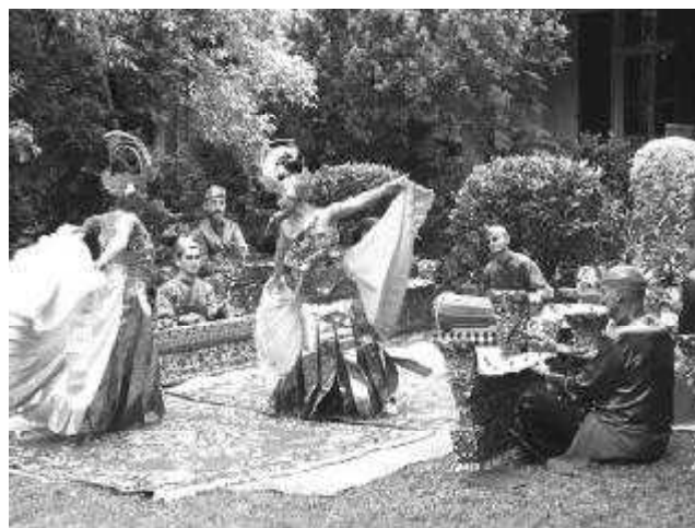
The Balinese Gamelan concert at Margaretta Cottage, Saturday, 20 November.