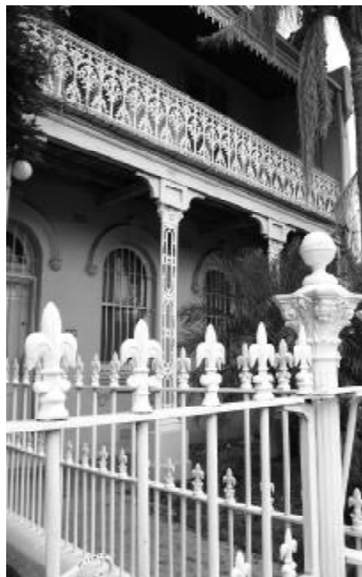
Glebe cast iron. Hereford Street terrace in full regalia.

Iron lace n. cast-iron ornamentation often of an intricate kind associated particularly with 19thC terrace houses. Also known as Sydney lace and Victorian filigree .