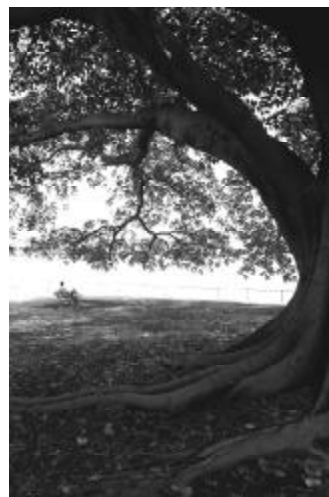
Blackwattle Bay, a preferred site for mangroves.