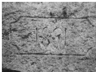
The date, 1891, engraved in the stone retaining wall. Photo: Mack Williams carrying out repairs to address safety concerns. However, these repairs appear to have been made with little or no consideration of the heritage significance of these structures.

of Public Works initiated a project entitled Parramatta Road 2000 & Beyond . The works included a replacement of a small section of stone capping as part of a larger restoration over three years. However, the restoration work was allowed to go uncompleted from 2000 until recent months when the Sydney City Council seems to have assumed responsibility for the wall,