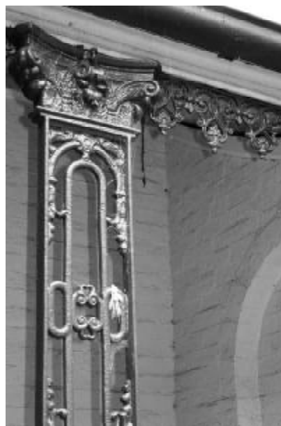
Laurel Tree House, Arundel Street: detail of a cast iron grille column, complete with an elegant capital.