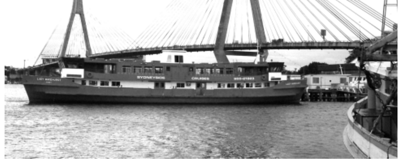
The Lady Wakehurst moored near the Fish Market.

The Society has devised the ideal opportunity for you to find out more about proposals for the foreshore of Rozelle and Blackwattle Bays while enjoying a cruise on the Harbour and mixing with people from all over Glebe!