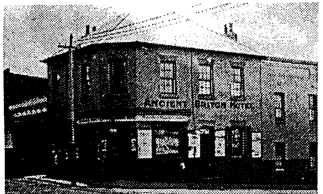
c.1910 view of Ancient Briton Hotel, corner Bridge Road