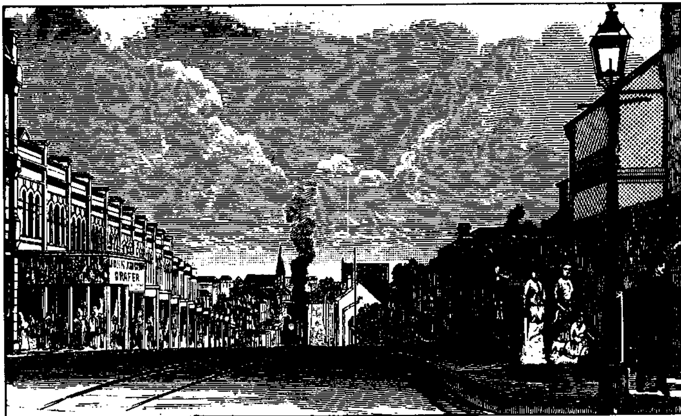
Glebe Point Road viewed from St John's Road. From a newspaper engraving, 1882.

The Department of Housing's new "Glebe Estate Walk" brochure features a picture of the fine group of shops in Glebe Point Road near the Post Office. That picture is reproduced below to show what could be done with the re-introduction of posted awnings. Copies of the brochure are available from the Department of Housing Office at 115 Glebe Point Road.