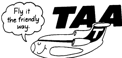
Animated plane called 'Smiley' introduced in 1972.

Although it has been argued that no one would want to use an airport as far out as Badgerys Creek, let alone Wilton, a considerable amount of traffic could be moved from Kingsford-Smith. Charges at the new airport would be lower, and it would thus be attractive to operators of smaller aircraft, charter flights and package tours. This would relieve congestion at Kingsford-Smith. At present Kingsford-Smith accommodates a mix of aircraft types, which limits its capacity.