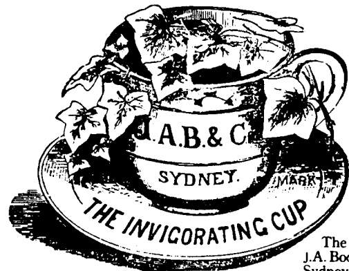
The Invigorating Cup. J.A. Booth & Co., Sydney. Tea, coffee, cocoa; 1913.