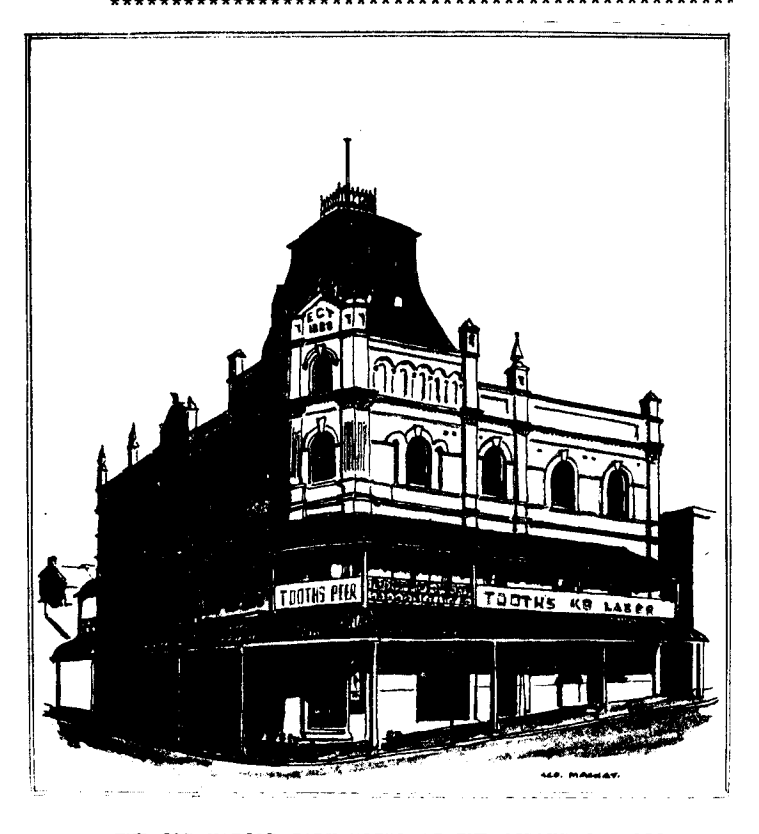
THE OLD HAROLD PARK HOTEL AT THE CORNER OF ROSS STREET AND WIGRAM ROAD. FORMERLY KNOWN AS THE LILLYBRIDGE HOTEL, IT WAS ERECTED IN 1888 AND DEMOLISHED IN 1959.