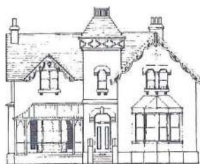
Reussdale (Circa 1870)