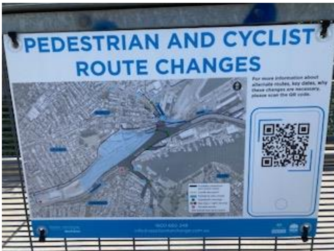
Sign disclosing the route to be taken by pedestrians to cross Victoria Road

For instance, a person who takes the 433 bus from Glebe to the White Bay Exhibition venue at present can only legally cross the road by walking south, then following the cycle route under Victoria Road or by walking north to the nearest pedestrian crossing at Darling Street. Both alternatives involve roughly a kilometre detour. Once the park reopens pedestrians will need to climb down about a staircase of about 4 storeys and climb up a similar flight on the other side. This is not a viable option for anyone who has difficulty with stairs. At night the underpass would be extremely uninviting.