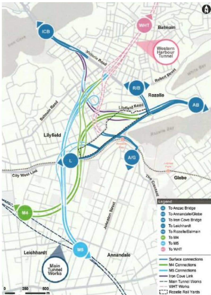
Figure 1.2: Overview of the Rozelle Interchange Project

( West-Connex M4-M5 Link Residual Management Plan , Transport for New South Wales, Feb 2023 Version 2.0)