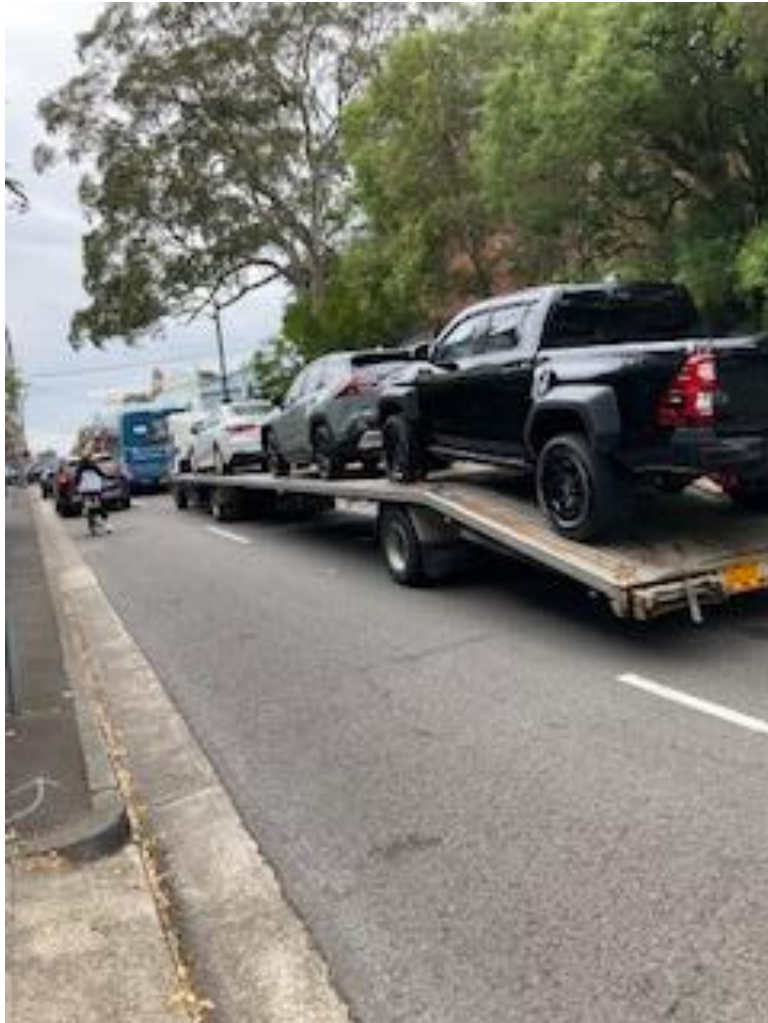
Heavy vehicles in The Crescent/Ross Street

Congestion along The Crescent and Ross Street is made worse by the introduction of a new pedestrian crossing on the western side of the intersection of Ross Street with Paramatta Road. Because of the red arrows for both left and right turning traffic very few vehicles can turn into Parramatta Road on one green light. The cycle privileges Paramatta Road traffic in any event.