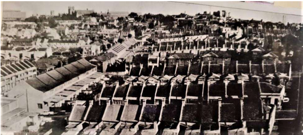
Figure 1 St Phillips estate Glebe, c. 1930 (State Library of NSW)

Glebe is located only three kilometres from the Sydney CBD. It is a high density nineteenth century suburb which predominantly comprises terrace houses on small blocks.