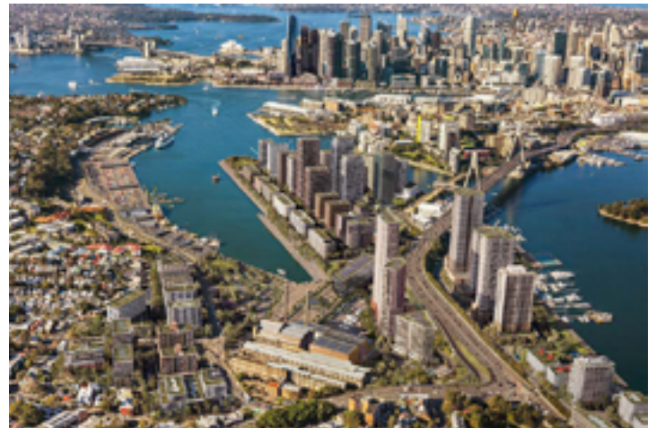
Bays West artist's impression.

Of interest to the Inner West and a pointer to relevant issues is the report commissioned and published by the NSW Government on the future of the Bays West Precinct. There is the full report which provides a comprehensive overview and a summary report , shorter and to the point, which contains details such as a tentative commitment to restoration of the old Glebe Island Bridge, made possible by exporting commercial enterprise to White Bay, though how the New Fish Market ferry will be handled is not explained.