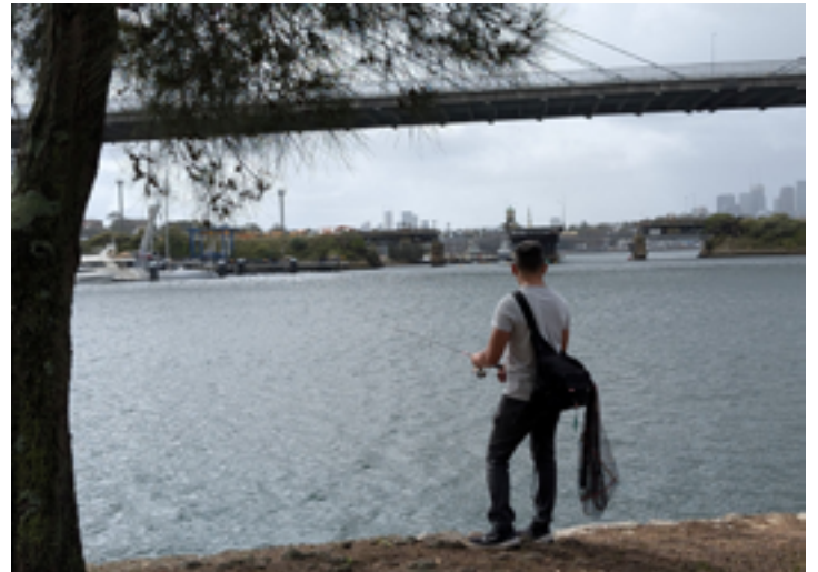
Fishing in the bay by Caroline Lipovsky

You can check out the rules on our website: https://glebesociety.org.au/in-focus-photo-comp-rules/