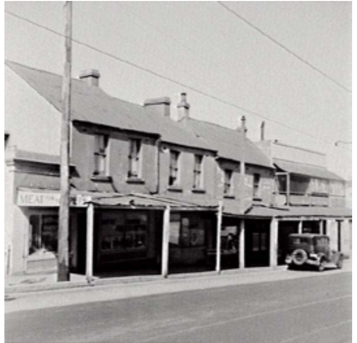
115 Glebe Point Road at far right, 1953.

The building was named Fascination House by the late 1960s when it was occupied by an antique dealer who was also a craftsman carpenter. Numbers 115-117 Glebe Point Road subsequently became the headquarters of the Commonwealth Glebe Project and a NSW Department of Housing office where tenants paid their rent. After the site went into private ownership, 35 formal objections were lodged in 1998 in response to a proposal to convert it into a hotel with an underground carpark. The Development Application was refused.