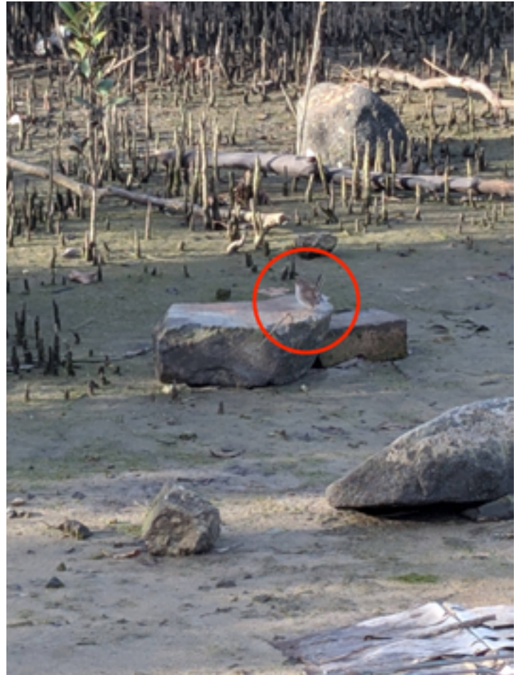
A non-breeding male wren at low tide in the Federal Park mangroves in Rozelle Bay

The President has written to the Lord Mayor ( President's letter ) saying that 'The City can take credit for its foresight in re-establishing the mangroves in Rozelle Bay. Restoring biodiversity sites in the middle of a large city is time consuming and complex – we congratulate the City of Sydney on such a successful outcome!' ●