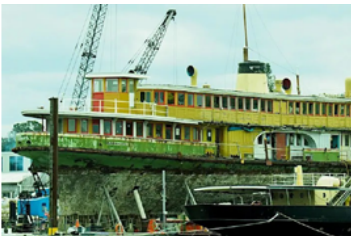
The Kanangra at the Sydney Heritage Fleet shipyard