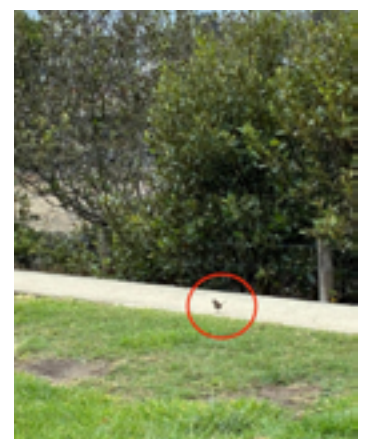
A wren feeding in the grass adjacent to the mangroves