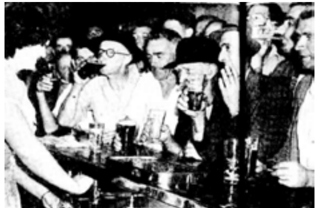
Caption from newspaper: 'This is a typical scene just before closing time – and not a very aesthetic one!'