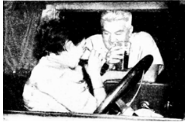
Caption from newspaper: 'To avoid the crowded bar parlors some women prefer to take a beer through the window of a parked car.' (Source: 'Sydney's beer guzzle: what do you think about it?' Smith's Weekly, 11 February 1950)

Time was our enemy as the talk had to end around 6pm because the room was booked for another group, so many of the audience continued the theme of the talk by ordering drinks and a meal. ●