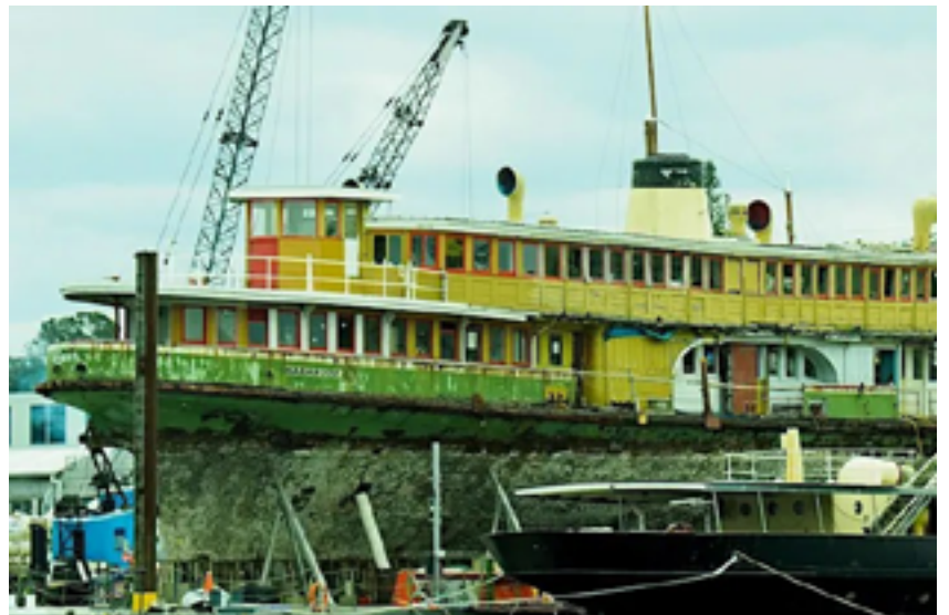
The Kanangra at the Sydney Heritage Fleet shipyard