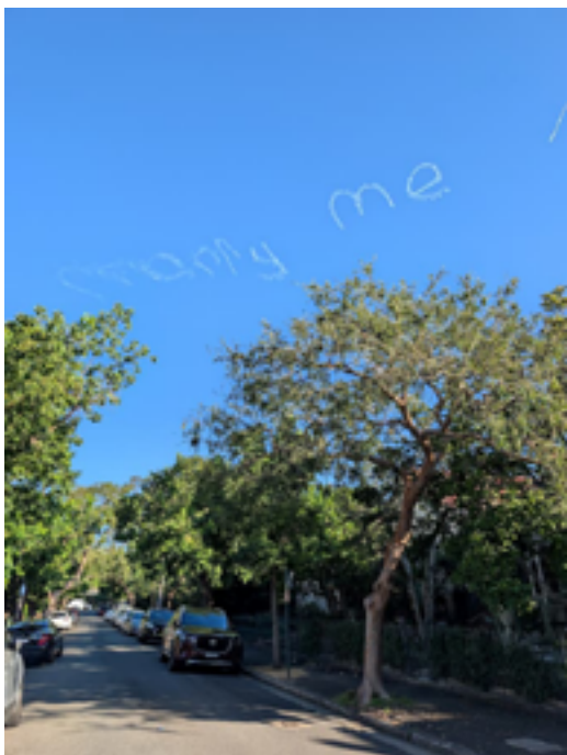
Proposal by Caroline Lipovsky

To make sure your entry has a chance to be featured, make sure it is a high-resolution image, with all details as clear as possible. A top tip is also to make sure your horizon is straight. You can check out the rules on our website .