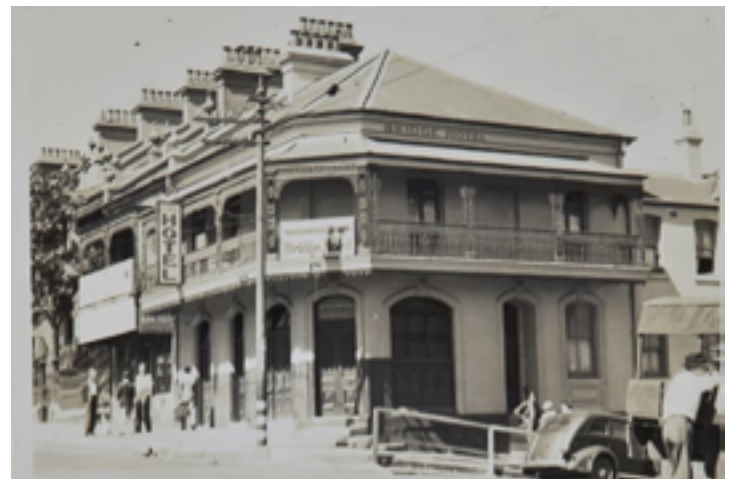
The Bridge Hotel in 1949

Pubs came and went. In 1857 there were 11 pubs. By 1874 there were 21 pubs, 4 having closed and 14 new pubs having opened. Many were located on Church lands, close