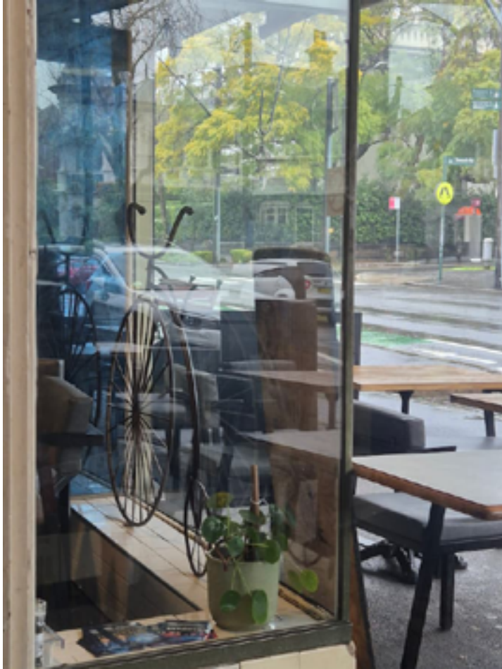
Reflections