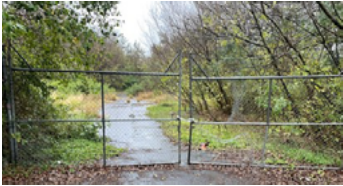
Entrance to Glebe's Hill