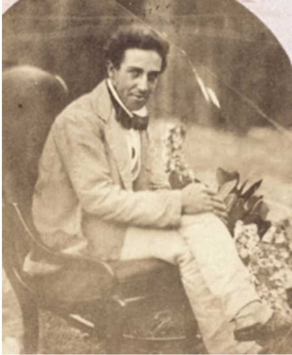
Jevons' self-portrait, Sydney, February 1858.