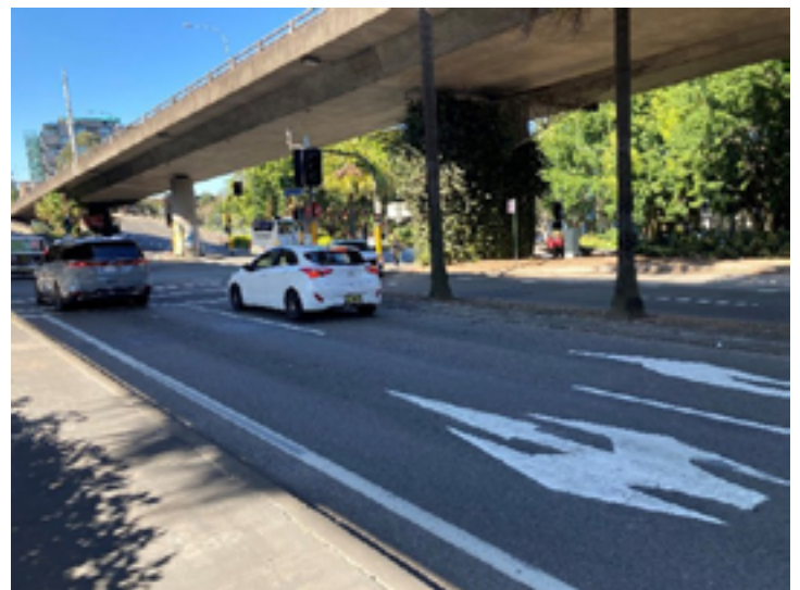
Bank Street at the junction with Pyrmont Bridge Road

The Glebe Society, which supported Pyrmont Action, congratulates the group on what feels like a rare win for the local community. ●