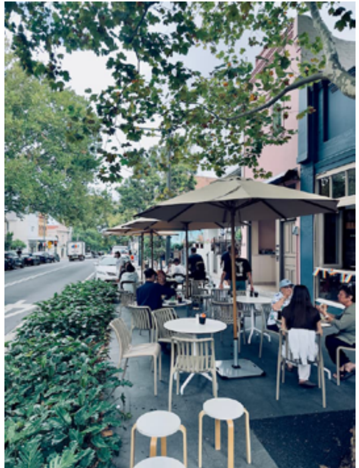
An example of greener, accessible and safe master-planned outdoor dining

Read the Glebe Society submission here. ●