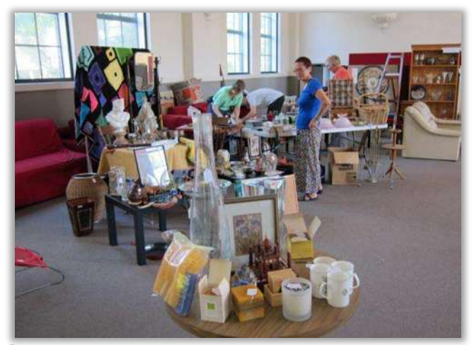
Glebe Grunge and Glory': Glebe Society participates in the Garage Sale Trail.