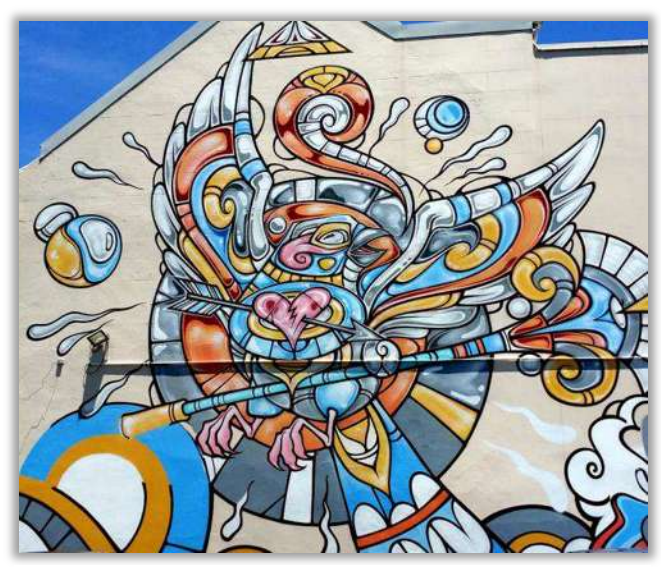
Wall art on a terrace wall, corner of Bridge Rd and Taylor St, Glebe