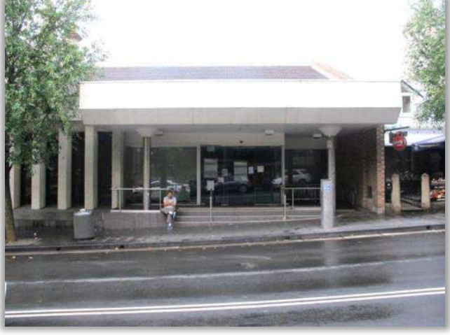
Former Commonwealth Bank building, Glebe Point Rd