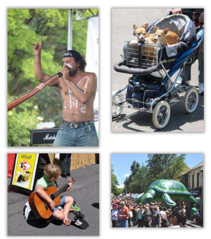
Scenes from the 2014 Glebe Street Fair