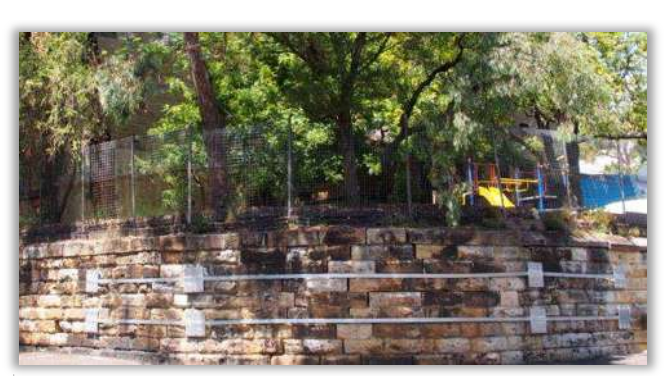
Forest Lodge Primary School sandstone retaining wall: gross repair