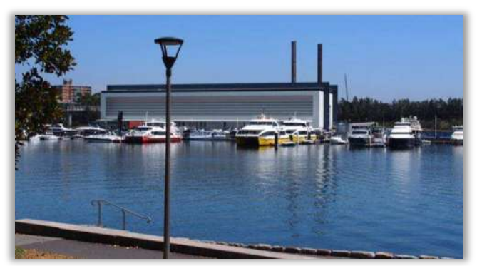
Dry Boat Store (2014), looking north from the Glebe foreshore

Ross St carries significant, and increasing, amounts of traffic and it is mortifying to think that visitors and commuters might conclude that the management of the repair of this highvisibility site represents how we in Glebe conserve and maintain our precious heritage.