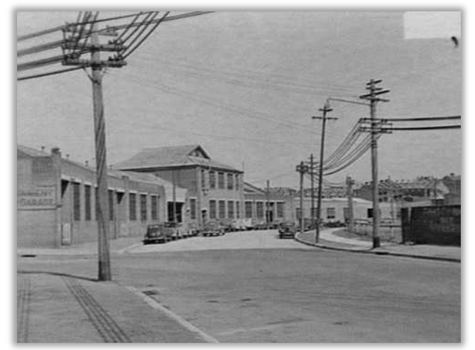
The Government Motor Garage at 7 Bay St Glebe in 1953

If you have not already done so, please take a few minutes to sign this Charter at http://thecommunitycharter.org/. It is important to keep up the pressure on the State Government in the lead up to the State Election in March, so any changes to the planning legislation are in accordance with the needs of the wider community, not just developers.