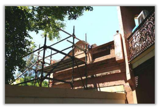
The old butcher's shop on the corner of Franklyn St and Glebe St. The venue is being refurbished by City of Sydney.