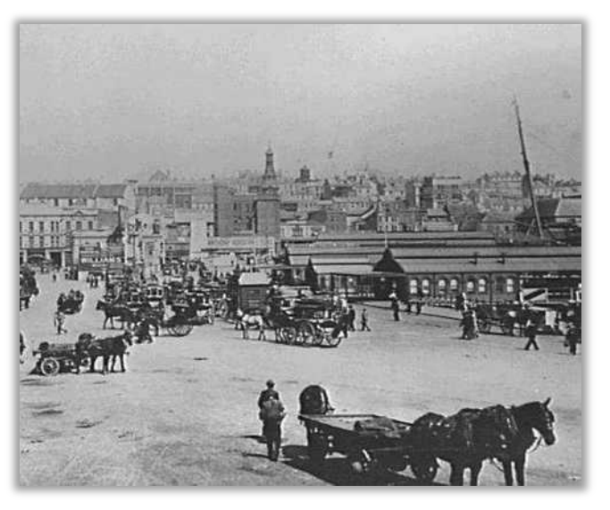
Horse drawn wagons at the wharves at Circular Quay, c.1890s

As well as supporting re-use of household goods, we raised $350 for Centipede and were pleased to be able to present a cheque to Friends of Centipede at the Sunset Soiree on 7 December.