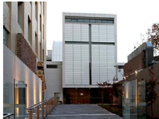
The new 'Barneys'.