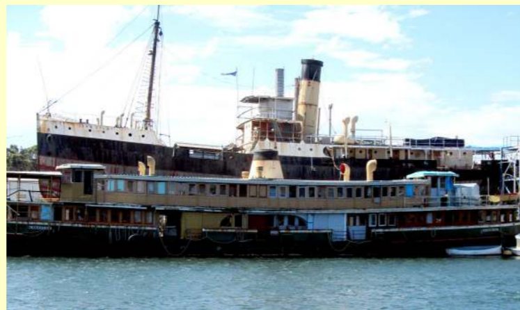
Sydney Heritage Fleet ships in Rozelle Bay in 2010. Foreground: former Sydney Harbour ferry Kanangra, background: John Oxley.